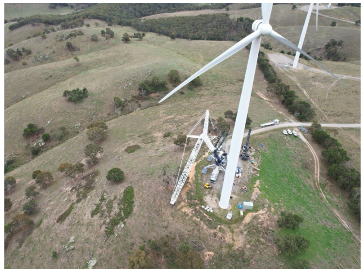
Above: Multiple cranes are used in the generator replacement works

We acknowledge the Gundungurra people as the Traditional Custodians of the lands upon which Gullen Range Wind and Solar Farm and Biala Wind Farm operate and their continuing connection to Country. We pay our respects to Aboriginal and Torres Strait Islander cultures and to Elders past, present and emerging.