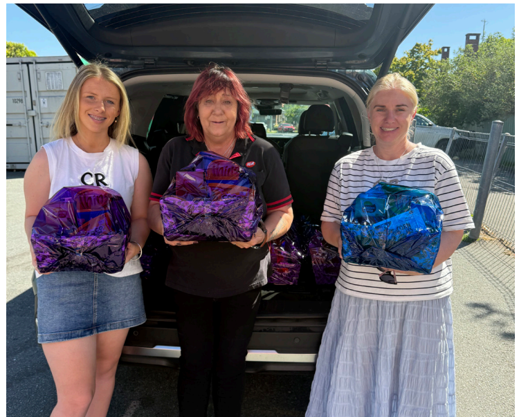
Above: Meals on Wheels volunteers with a representative from IGA Crookwell and some of the lovely hampers

This initiative has become a valued tradition, and the team looks forward to continuing to support local programs throughout 2026.