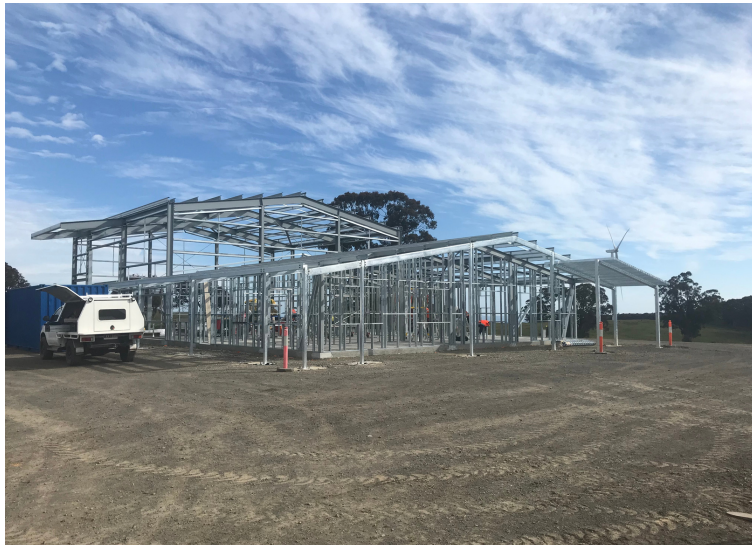
Civil works for our Operation and Maintenance Building are now complete

Construction progress has been rapid since our last newsletter. 18 of the 31 turbines are now fully erect and electricity is being exported to the electricity grid. Approximately 10 turbines should be generating electricity by the end of October. Civil works and steel framing for the Operation and Maintenance Building are complete, with the building due for completion within two months.