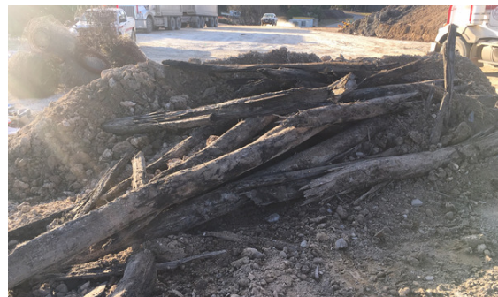
Image: Subgrade materials underground

At times work may be conducted on two sections of the road at the same time. This should help to reduce the overall construction time but may mean a second set of traffic lights needs to be used.